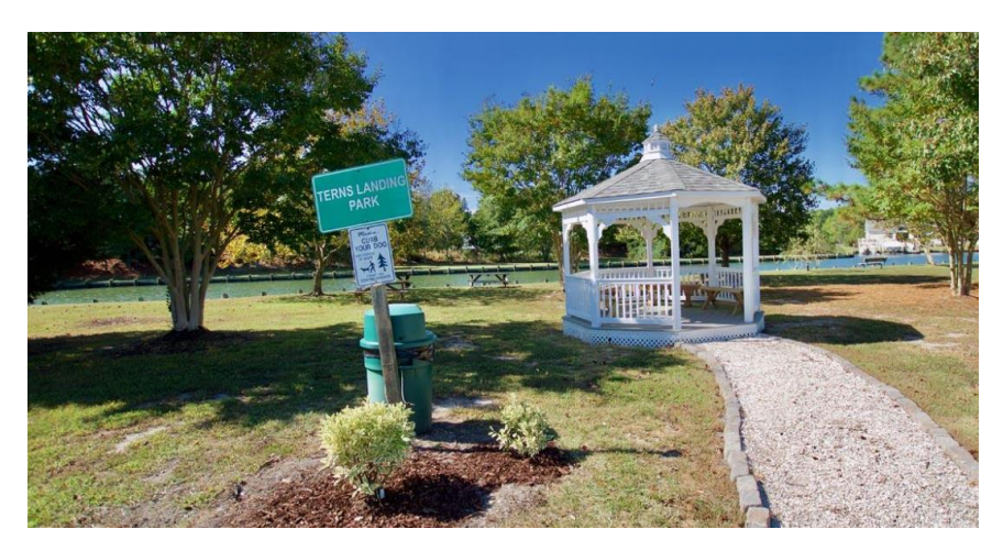
Recreation and Parks