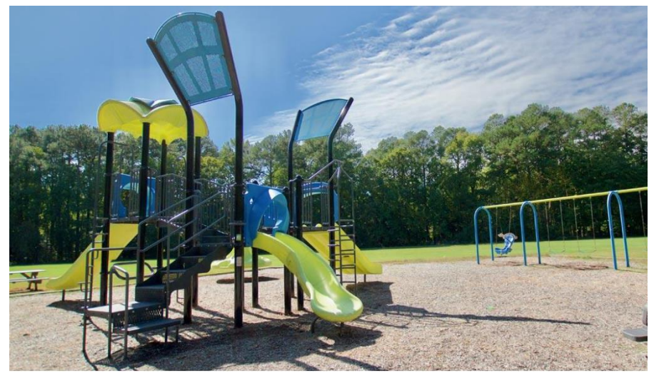
Recreation and Parks