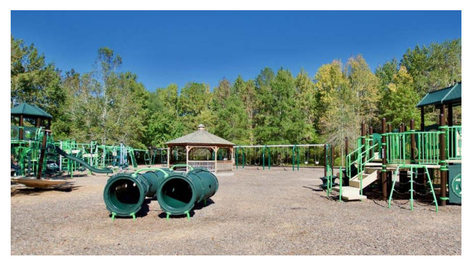
Recreation and Parks