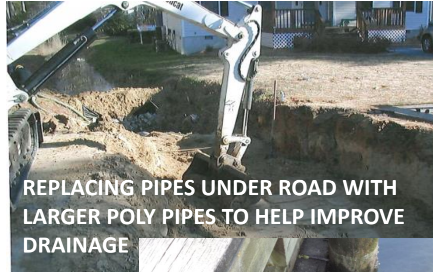
REPLACING PIPES UNDER ROAD WITH LARGER POLY PIPES TO HELP IMPROVE DRAINAGE