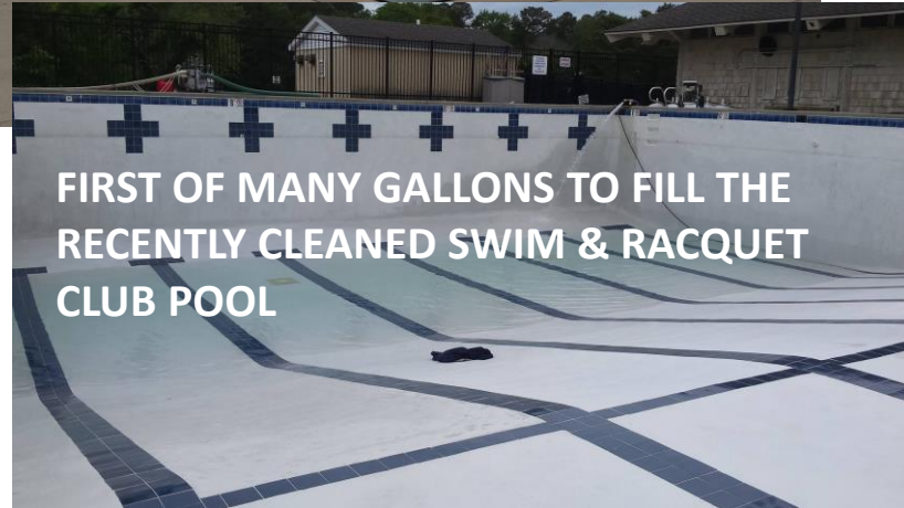
FIRST OF MANY GALLONS TO FILL THE RECENTLY CLEANED SWIM & RACQUET CLUB POOL