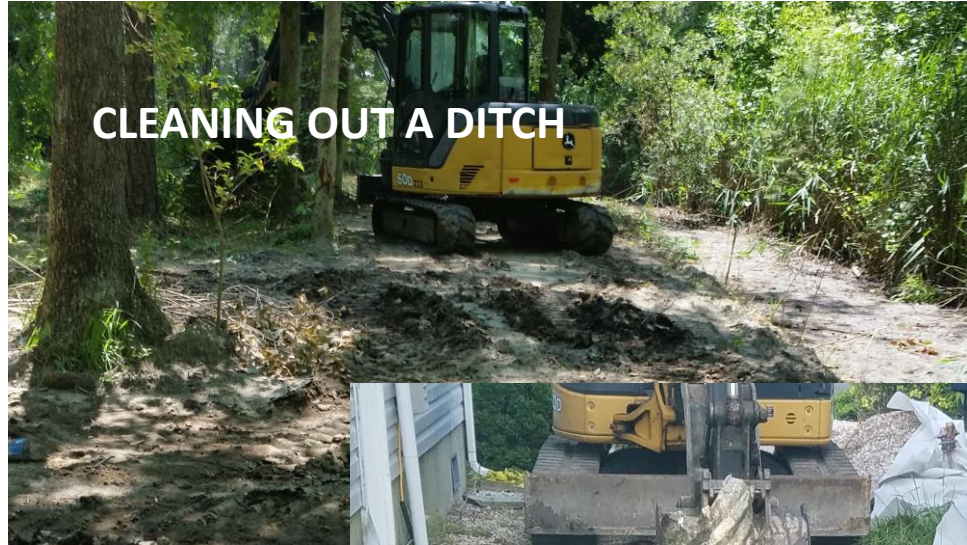
CLEANING OUT A DITCH