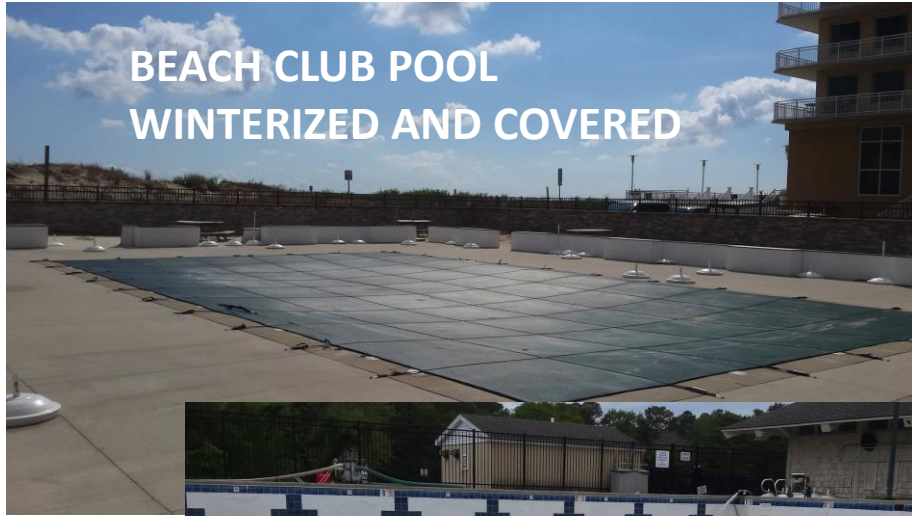
BEACH CLUB POOL WINTERIZED AND COVERED