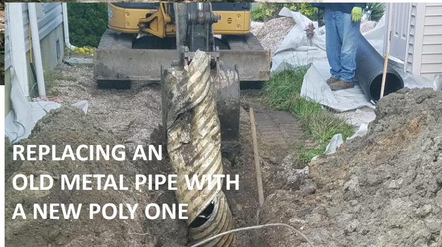
REPLACING AN OLD METAL PIPE WITH A NEW POLY ONE