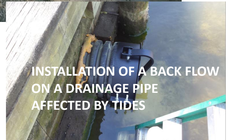
INSTALLATION OF A BACK FLOW ON A DRAINAGE PIPE AFFECTED BY TIDES