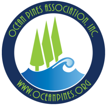
Ocean Pines Association