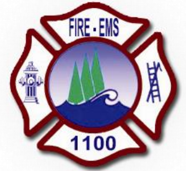
Donations / Fundraisers