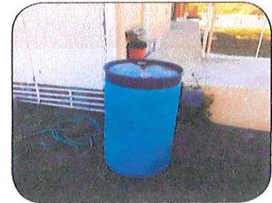
Keep rain barrels covered tightly.