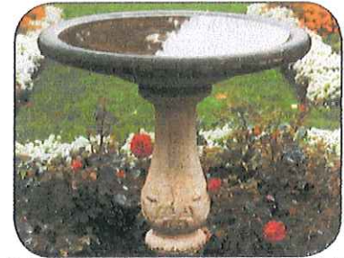
Weekly, empty standing water from fountains and bird baths.