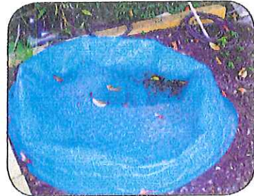
Drain water from pools when not in use.