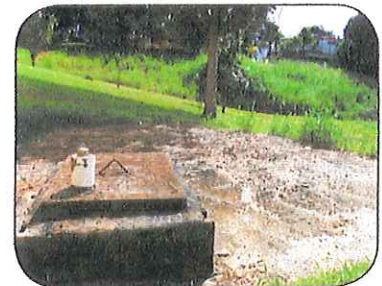
Keep septic tanks sealed.