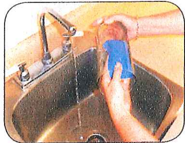
Weekly, scrub vases & containers to remove mosquito eggs.