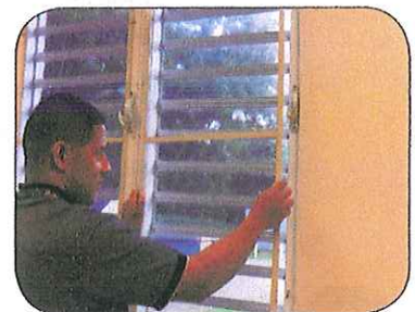
Install or repair window & door screens.

For more information, visit: www.cdc.gov/dengue , www.cdc.gov/chikungunya , www.cdc.gov/zika