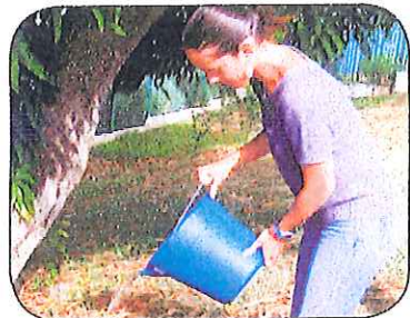
Drain & dump any standing water.