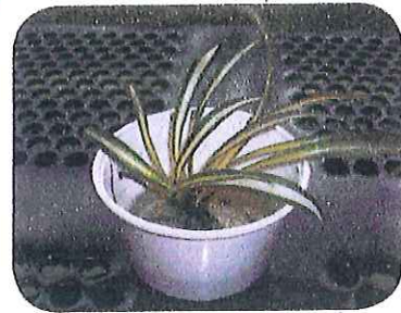
Put plants in soil, not in water.